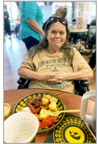
Iowa vs. Iowa State Tailgate